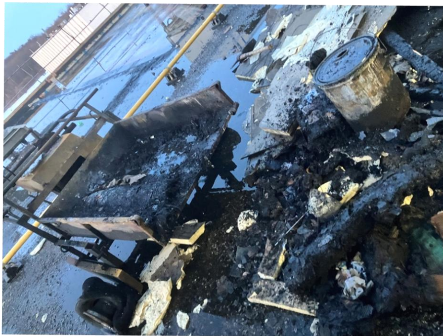
Figure 6 above: roofing repair equipment cart that contained lithium-ion battery portable light