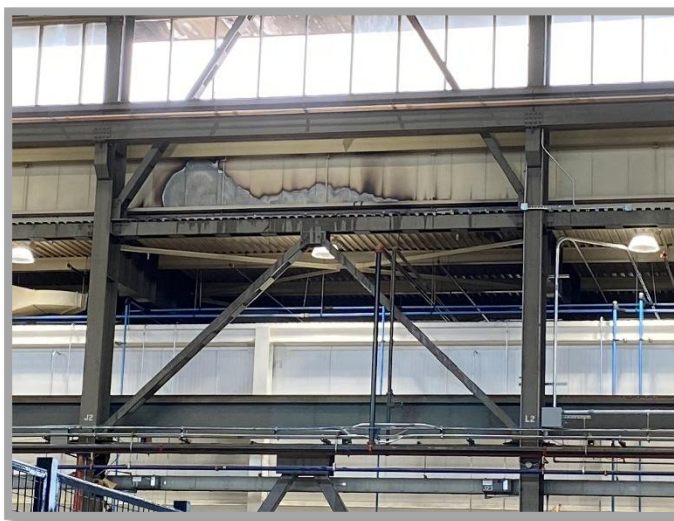
Figure 4 above: building interior damage where fire breached building exterior