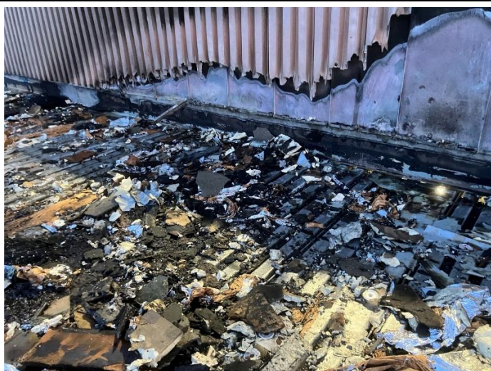
Figure 3 above: section of the roof that breached building exterior