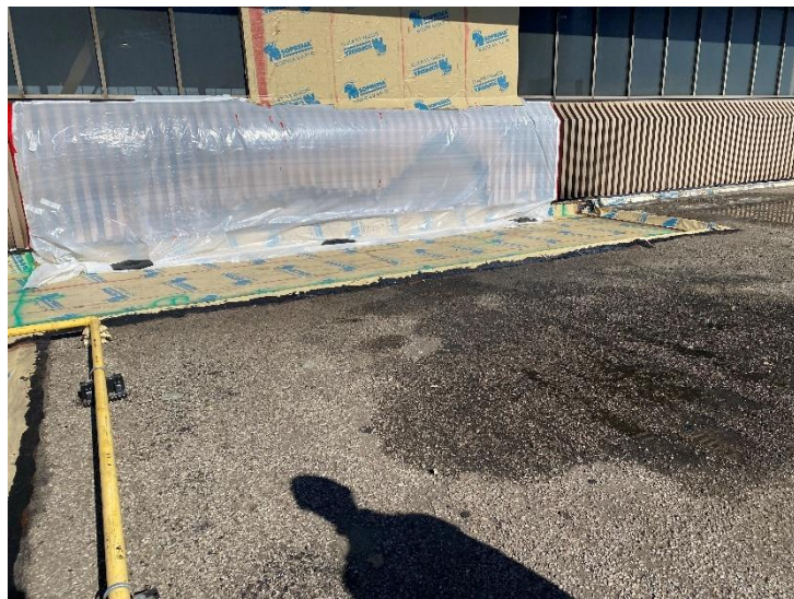
Figure 7 above: area of the roof and building wall panels showing the plywood and tarp material installed in place of the roof windows as temporary protective measure