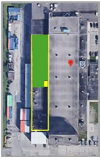
Figure 1 above: yellow square indicates roof fire location; green is previously completed roof repair; balance of area within the yellow border is remaining section of the roof where repair work has not commenced