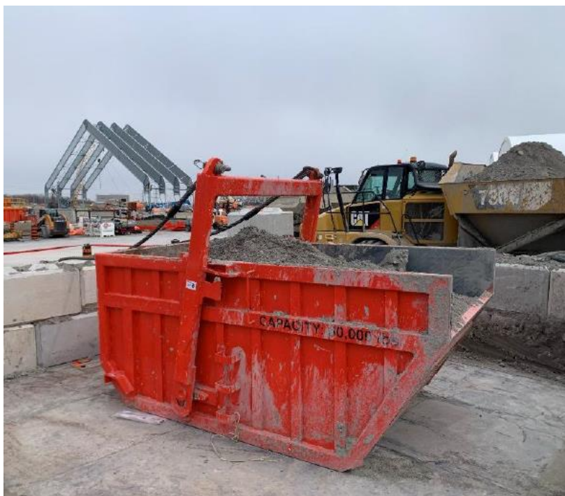
Figure 2: The inside of the enclosure; the large red bin shifted and pinned the worker against the concrete block wall.

EIR: Workplace injury at Ontario Power Generation's Darlington New Nuclear Project Site