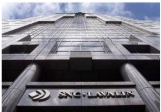
The offices of SNC-Lavalin are pictured on March 26, 2012 in Montreal.