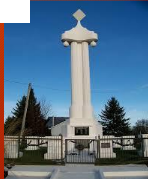
The Alderville War Monument was unveiled on Sunday September 25, 1927