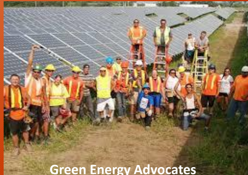
Green Energy Advocates