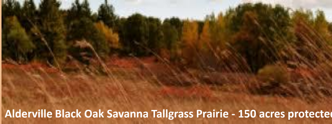
Alderville Black Oak Savanna Tallgrass Prairie - 150 acres protected