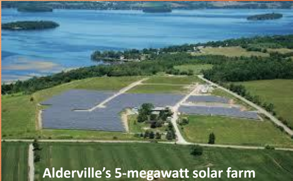
Alderville's 5-megawatt solar farm