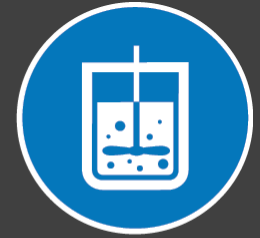
RARE EARTH ELEMENTS