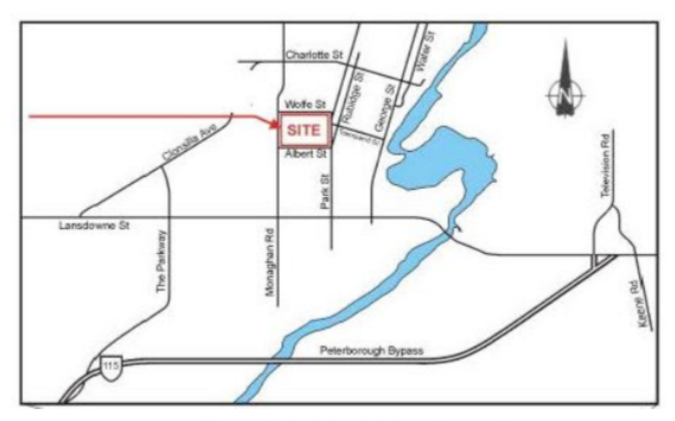
Figure 2: BWXT NEC Peterborough