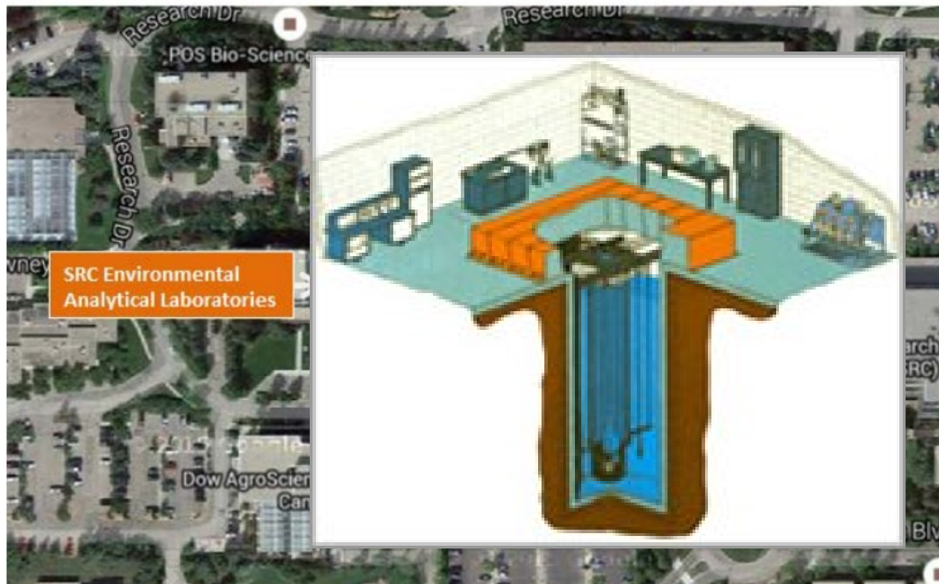
FIGURE 2-7: SASKATCHEWAN RESEARCH COUNCIL SLOWPOKE-2 FACILITY