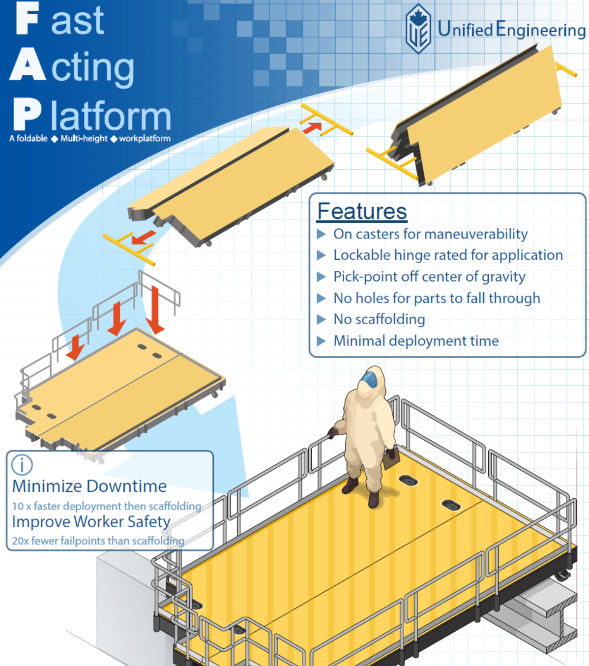
Figure 3: Infographic Fast Acting Platform