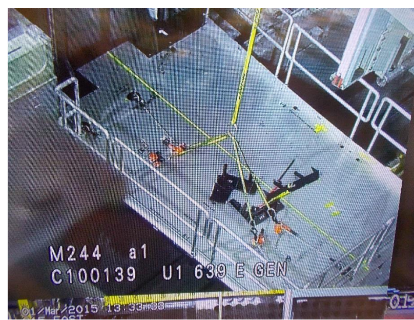
Figure 1: Deployment of Fast Acting Platform