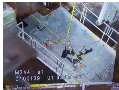
Figure 2: Deployment of Fast Acting Platform