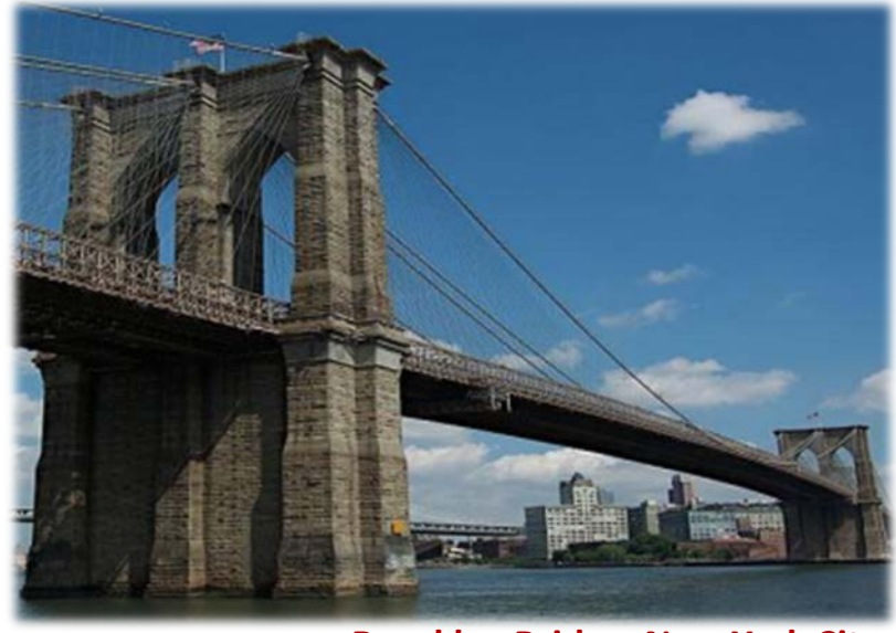
Brooklyn Bridge, New York City