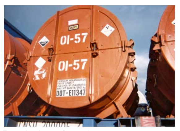
Example of a certified package

Packages designed for the transport of high risk levels of radioactive material require certification by the CNSC before they can be used in Canada. Persons must register their use of the package with the CNSC and acknowledge that they have the necessary training to properly prepare it for shipment. These packages are required to undergo stringent testing since improper handling of their contents can give rise to severe consequences. Testing must simulate both normal and hypothetical conditions of transport and can include free-drop testing, puncture testing, thermal testing, and simulated aircraft accidents. These packages are designed to transport material such as Cobalt-60, sources used for industrial radiography, used nuclear fuel, and enriched uranium.