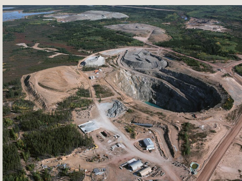
1999 - Cluff Lake operational