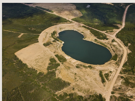
2008 - Cluff Lake decommissioned