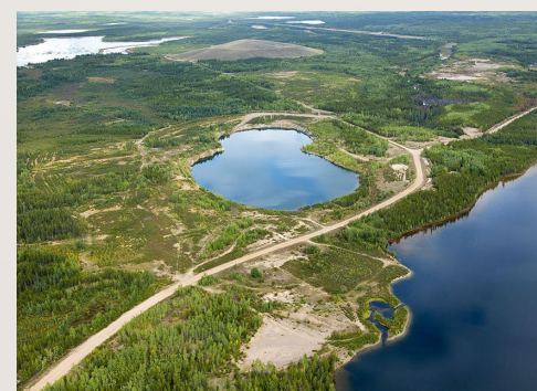
2014 - Cluff Lake decommissioned

The CNSC requires nuclear facility operators to provide financial guarantees to cover the costs of decommissioning and long-term waste management to ensure no burden is left to future generations.