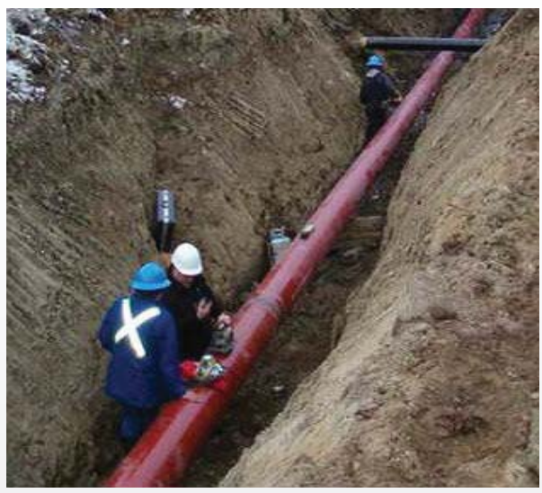
Continued on page 2.

device and the typical working environment where the device is used. In 2004, the International Atomic Energy Agency (IAEA) published the Code of Conduct on the Safety and Security of Radioactive Sources (the Code), and subsequently requested every country to upgrade their safety