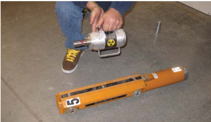
Safety concerns with the GammaMat M-10 industrial radiography camera resulted in the recall of 18 of these exposure devices by MDS Nordion.

The CNSC's investigation revealed that a GammaMat M-10 camera left the servicing company in Edmonton on December 16, 2008, and arrived at Nordion in Kanata on December 22. It had been sent to Nordion to be reloaded with a fresh Iridium-192 source before being returned to the servicing company.