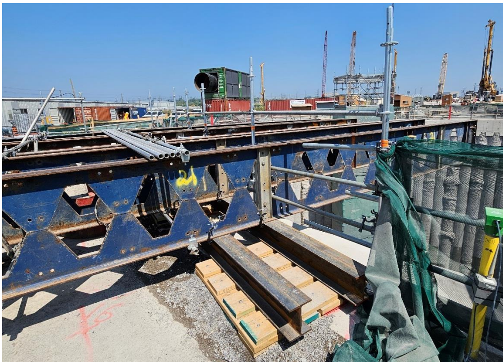
Figure 1: I-beams cantilevered over the Tunnel Boring Machine launch shaft

EIR: Workplace injury at Ontario Power Generation's Darlington New Nuclear Project Site