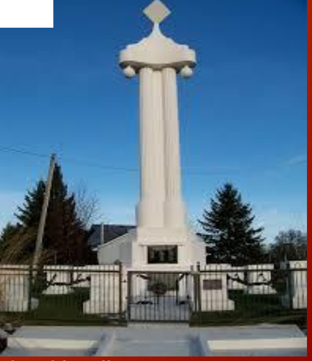
The Alderville War Monument was unveiled on Sunday September 25, 1927