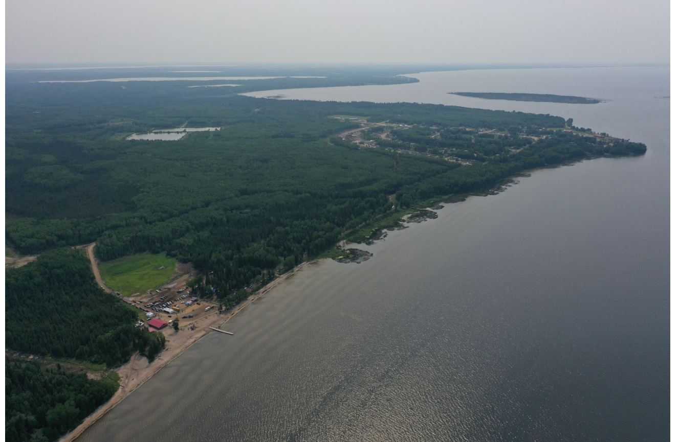
CRDN Community, 2023.