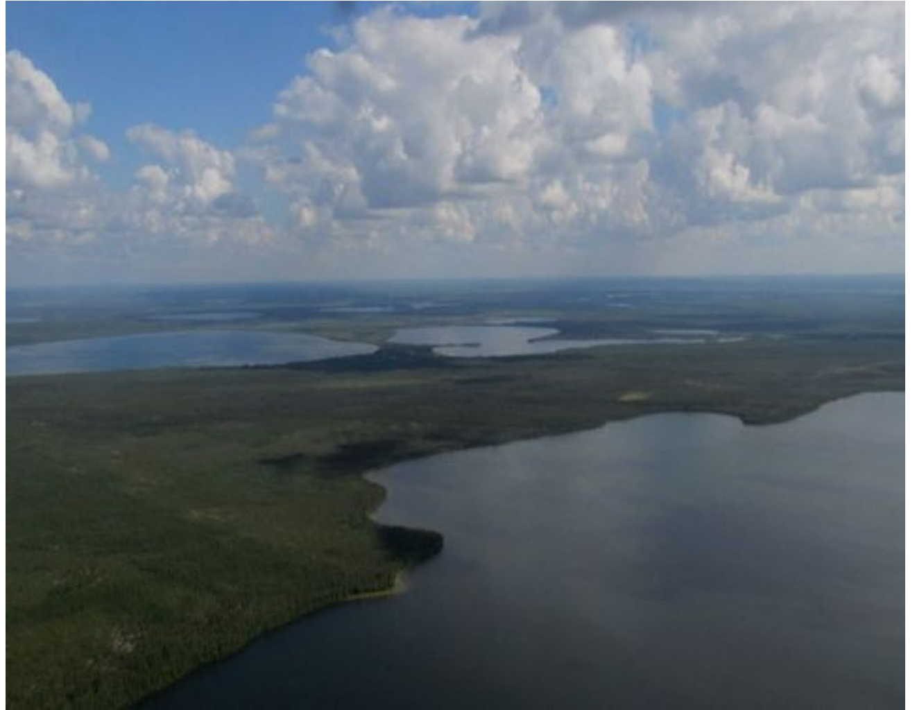
Patterson Lake.