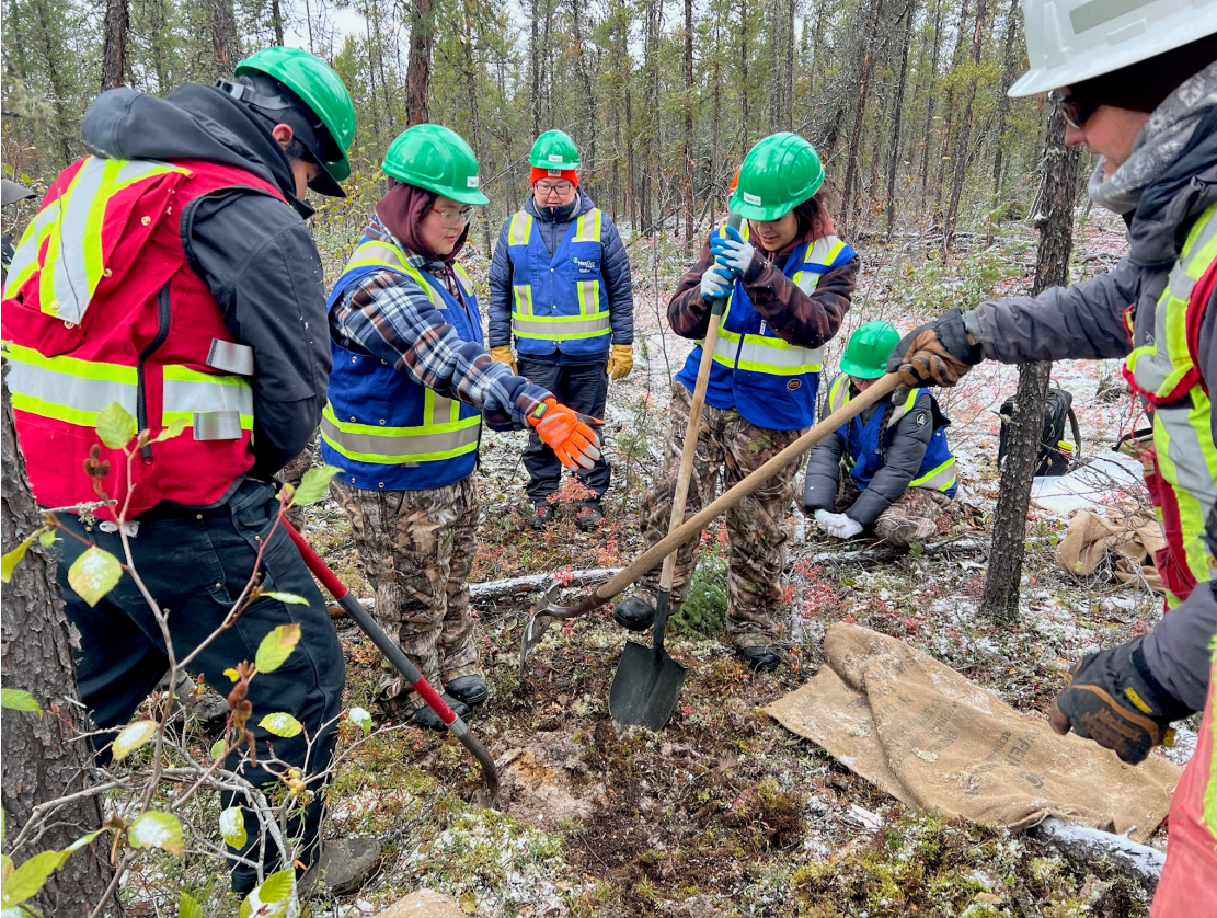
Students from Clearwater River Dene School collecting seeds at the Rook I Project site, 2024.