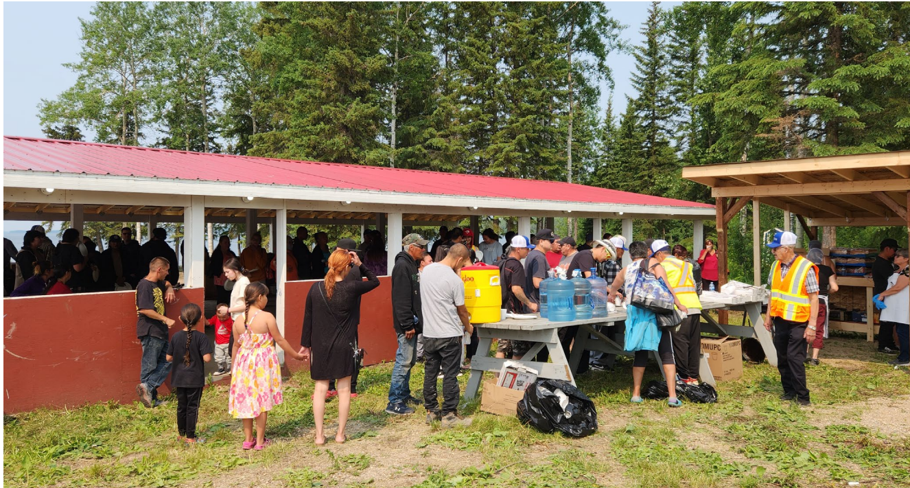
Community Information Session in CRDN, 2023.