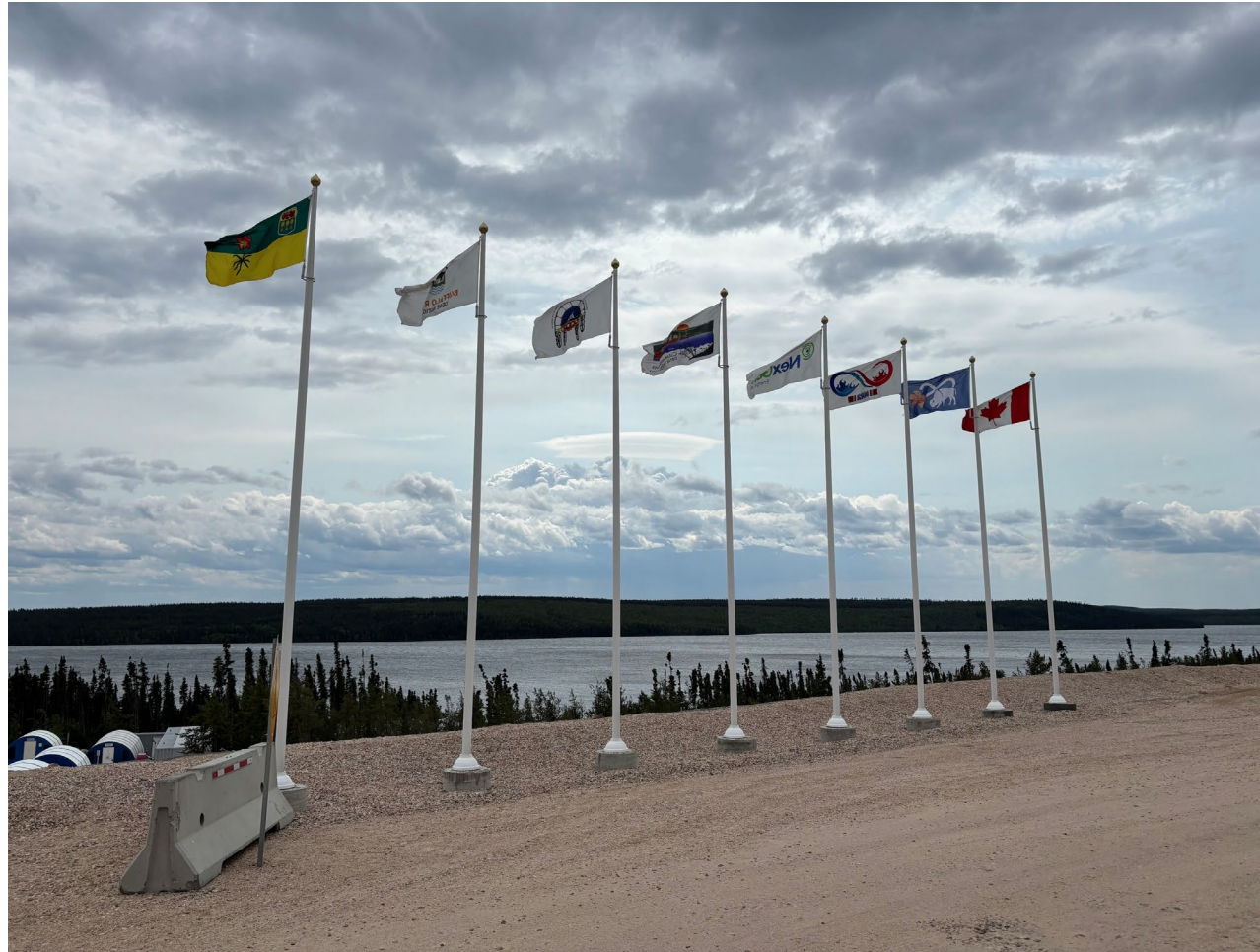
Flags at Rook I Site.