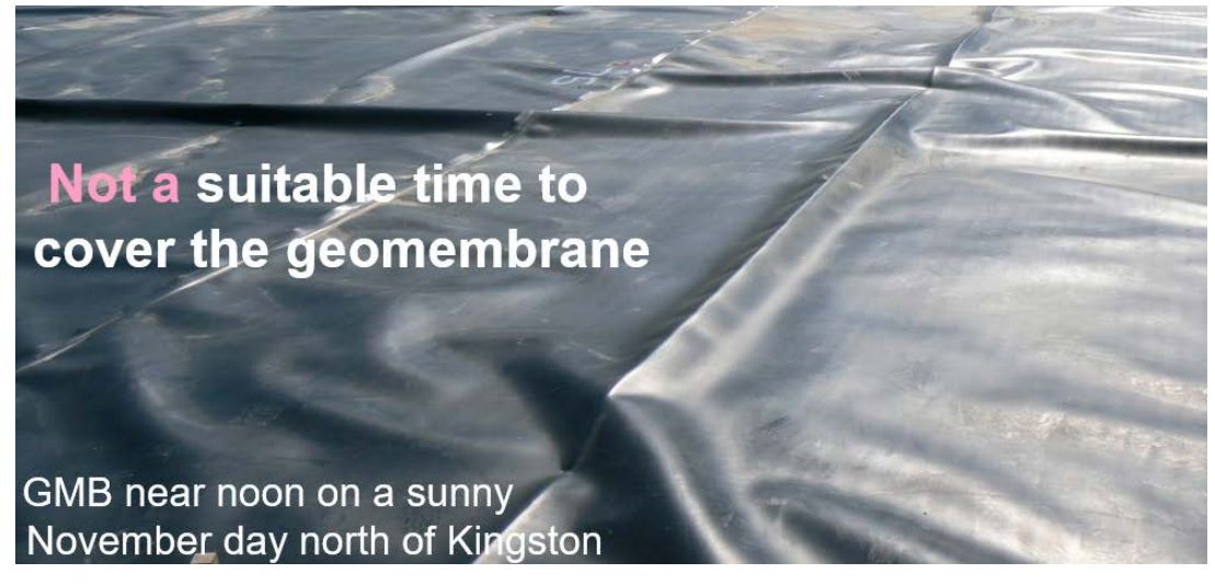
Figure 3: To minimize/prevent leakage, the geomembrane should not be covered with protection soil with the wrinkling shown. The contractor would be required by the CQA consultant to defer covering until wrinkling decreases to a negligible level (e.g., Figure 4)