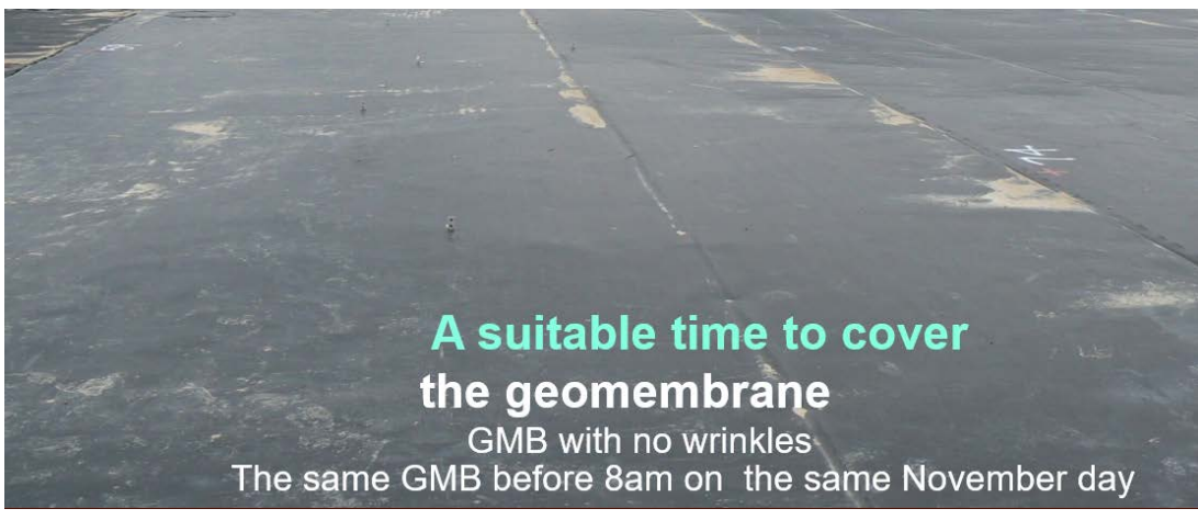
Figure 4: No wrinkles. The geomembrane can be covered with protection soil at this time.

Figure 3: To minimize/prevent leakage, the geomembrane should not be covered with protection soil with the wrinkling shown. The contractor would be required by the CQA consultant to defer covering until wrinkling decreases to a negligible level (e.g., Figure 4)