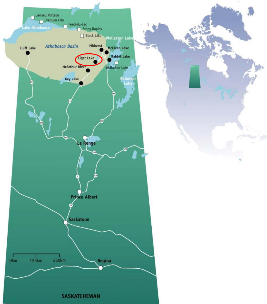
Figure 1.1: Location map

Operated by Cameco, the Cigar Lake Operation is joint venture owned by Cameco (50%), Orano Canada Inc. (Orano) (37%), Idemitsu Canada Resources Ltd. (Idemitsu) (8%) and Tokyo Electric Power Company Resources Inc. (TEPCO) (5%). The Cigar Lake Operation is located approximately 660 kilometres north of Saskatoon, Saskatchewan (figure 1.1). The First Nations communities of Wollaston Lake and Hatched Lake, the closest permanent communities, are located approximately 80 kilometres east of the facility.