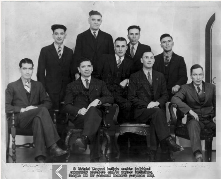
MÉTIS SOCIETY OF SASKATCHEWAN, 1935