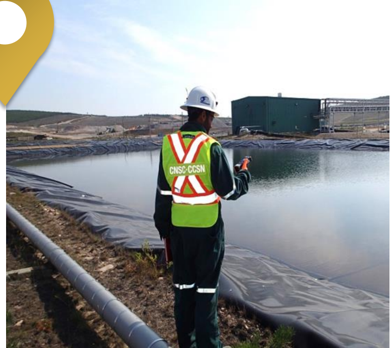
CNSC staff taking dose rate measurements at the McArthur River Operation.