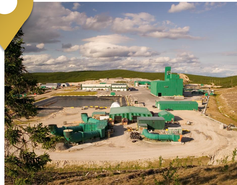
Cameco Corporation operates the McArthur River mine located approximately 620 kilometres north of Saskatoon, Saskatchewan.