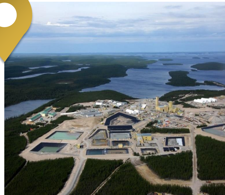
Cigar Lake Operation uranium mine, operated by Cameco Corporation, is located approximately 660 kilometres north of Saskatoon, Saskatchewan.