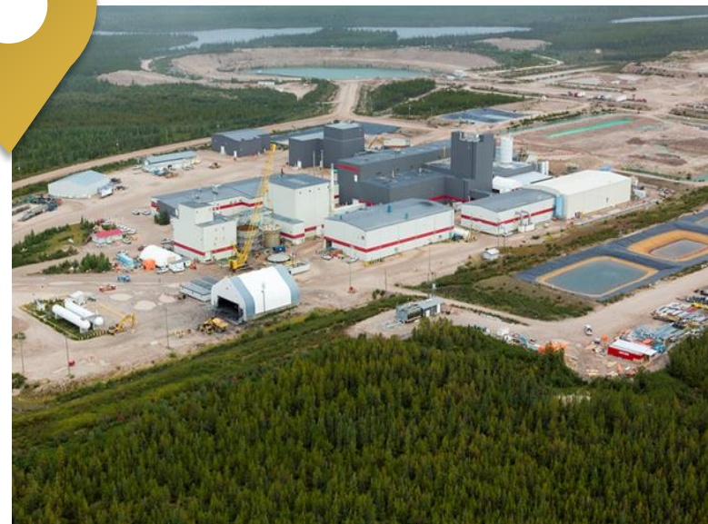
McClean Lake Operation, located approximately 750 kilometres north of Saskatoon, Saskatchewan, is operated by Orano Canada Inc.