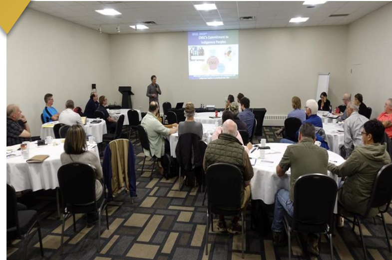
CNSC staff presenting information to the EQC members on September 4, 2019 in Prince Albert, SK.