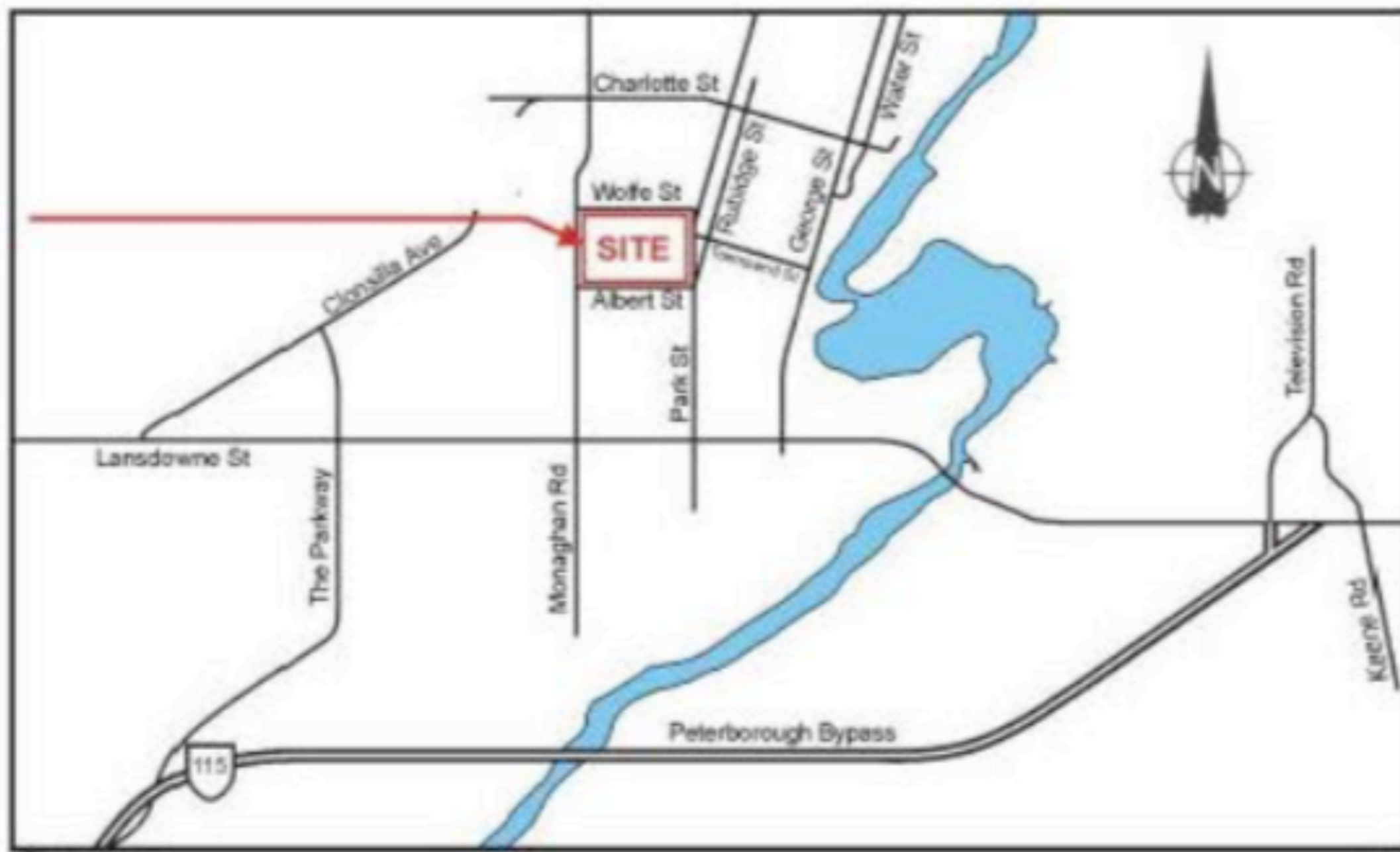
Figure 2: BWXT NEC Peterborough