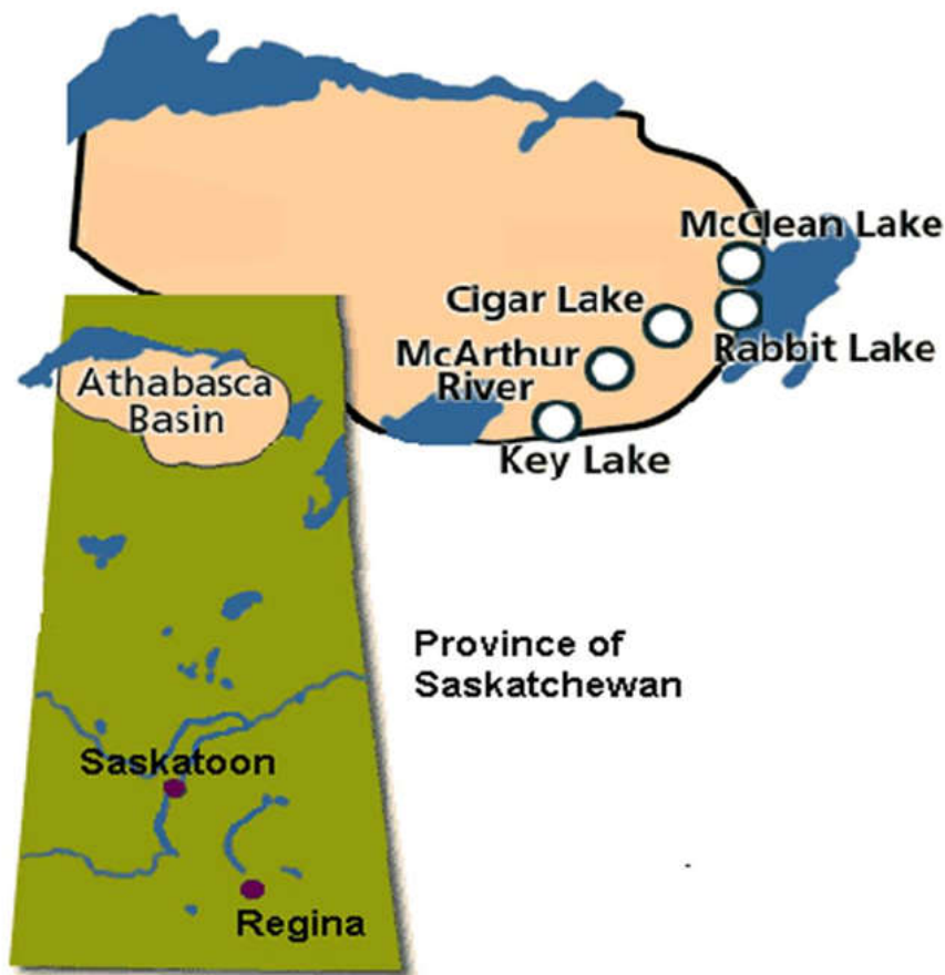
Figure 1: Rabbit Lake Operation – location map

Owned and operated by Cameco Corporation (Cameco), the Rabbit Lake Operation is located approximately 750 kilometres north of Saskatoon, Saskatchewan (figure 1). The Eagle Point underground mine is located at the northern margin of the property. Moving southward, three mined-out pits, two reclaimed, A-Zone and D-Zone, and one flooded, B-Zone pit all border Collins Bay of Wollaston Lake. The B-Zone pit remains isolated from Collins Bay by an intact dyke. In the central part of the property, the mined-out Rabbit Lake pit was converted to a tailings management facility (TMF). Adjacent to the in-pit TMF is the mill. South of the mill is the above ground TMF, which has not received tailings since 1985. At the southern margin, after passage through settling ponds, all treated effluent, which must meet discharge limits, is continuously discharged and eventually reaches Hidden Bay of Wollaston Lake. The general site layout of the Rabbit Lake Operation is shown in appendix A of this Commission Member Document (CMD).