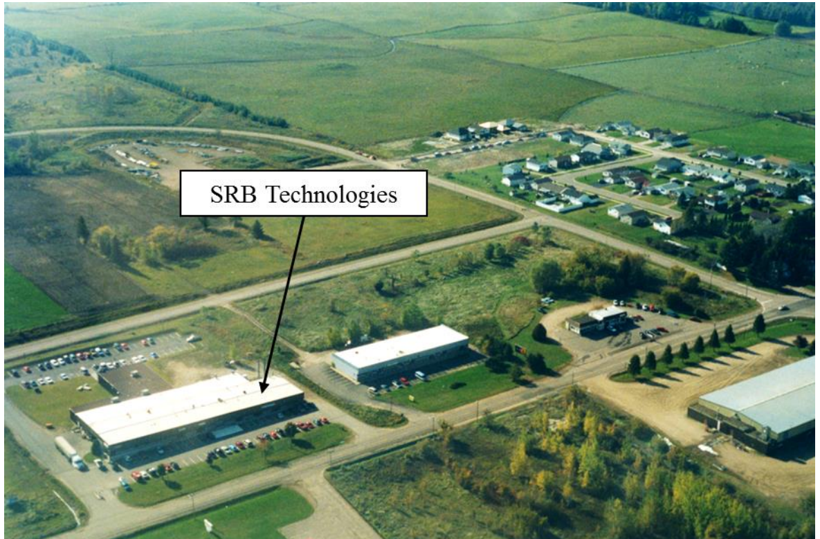
Figure 1-1: Aerial view of the SRBT facility

The SRBT facility processes tritium gas (HT) to produce sealed glass capsules that are coated with phosphorescent powder and filled with HT, to generate continuous light. Examples of such GTLS include signs, markers and tactical devices. The SRBT facility distributes products domestically and internationally.