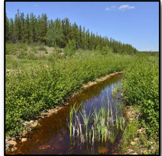
Fresh water diversion ditch - TMA

Orano continues to make adequate protection for the environment