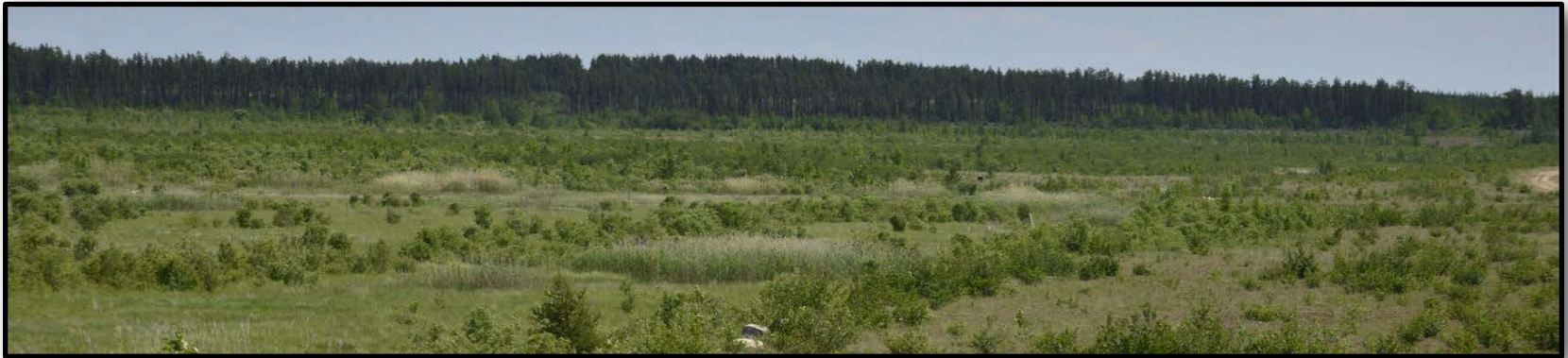
Cluff Lake Tailings Management Area

CNSC staff conducted compliance assessment through desk-top assessments of licensee submitted documents