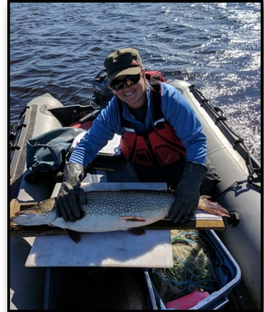
CNSC staff sampling fish in Sandy Lake near the Cluff Lake site