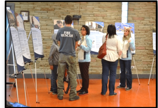
CNSC staff engaging the public

CNSC's Participant Funding Program (PFP) is made available to Indigenous peoples, members of the public, and stakeholders