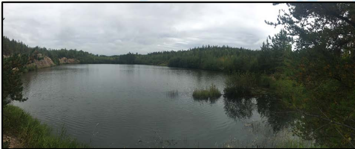
View of D-Pit Lake. August 2018.