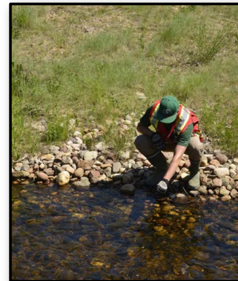
CNSC Contractor sampling water