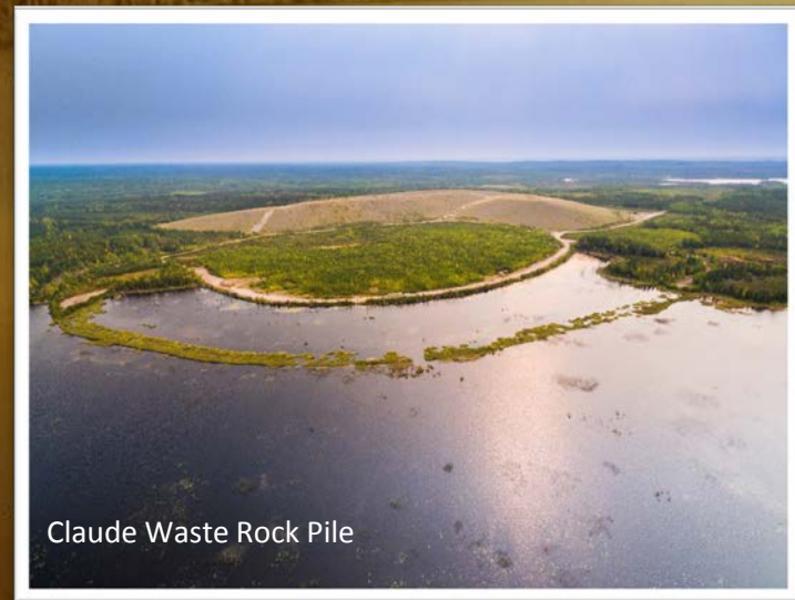
Claude Waste Rock Pile