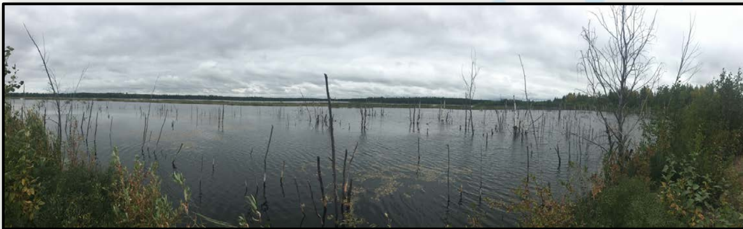
View of Claude Lake from on top of horizontal drains. August 2018.