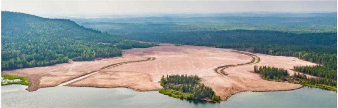
Lorado Mill Site, SK

Question: Do they use TEK here or just the science to understand the revegetation process?