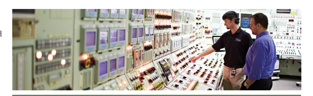
Pickering Nuclear Control Room

CAC members emphasized the importance of OPG keeping the community informed about the extended operation plans for the Pickering site and the continued commitment to safety.