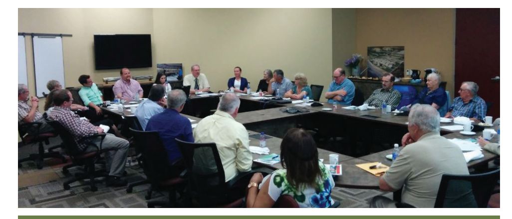
Joint meeting with Pickering and Darlington CAC members at Darlington in October 2016

Noting that there are critics of the nuclear industry strongly opposed to the refurbishment, CAC members have asked OPG how they are going to help the public understand that the company is doing a good job on the project. The Council has been pleased to hear that OPG will continue to regularly provide Darlington refurbishment progress updates to the public.