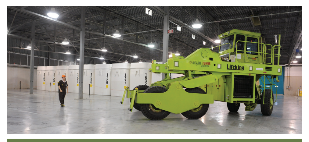
Dry Storage Container transport vehicle at Pickering Waste Management Facility

In 2013, a number of CAC members visited the site in Kincardine for OPG's proposed Deep Geologic Repository (DGR) for the long-term storage of low and intermediate level nuclear waste. They talked to OPG scientists about the type of rock layers deep underground in which the waste will be stored. Because low and intermediate level waste from the Pickering site