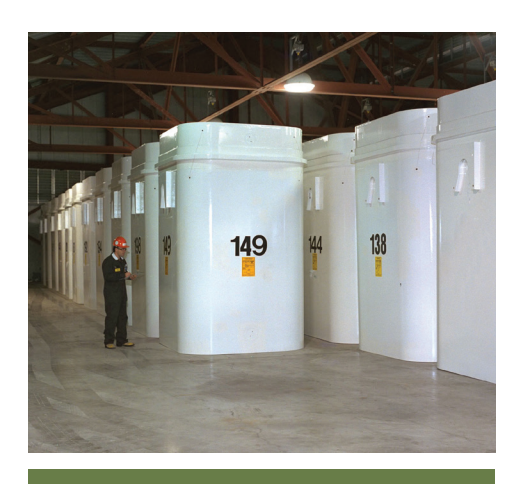
PWMF used nuclear fuel storage canisters

Based on this visit and their general experience of OPG's forthcoming answers to their questions about nuclear waste management, the CAC decided to write a letter of support for OPG's application to the federal regulator to renew the PWMF licence to operate.