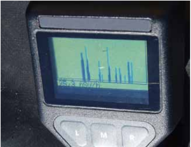
A portable gamma-ray spectrometer

In some cases, radioactive items can be identified based on their known shape, size, labels and markings. You can recognize radioactive material by the trefoil sign, which is the international symbol of ionizing radiation.