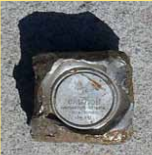
Americium-241 contained in a level gauge