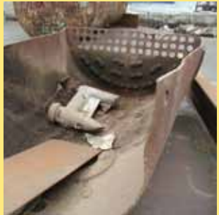
Cesium-137 contained in a fixed gauge