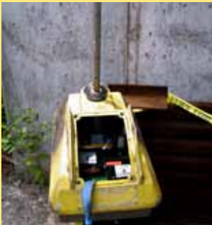
Americium-241/beryllium and cesium-137 contained within a portable gauge