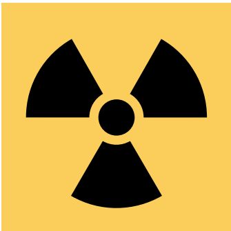
A trefoil symbol

In other situations, items can be identified as a result of acquired knowledge and experience. Identification is critical, in order to undertake the appropriate radiological response.